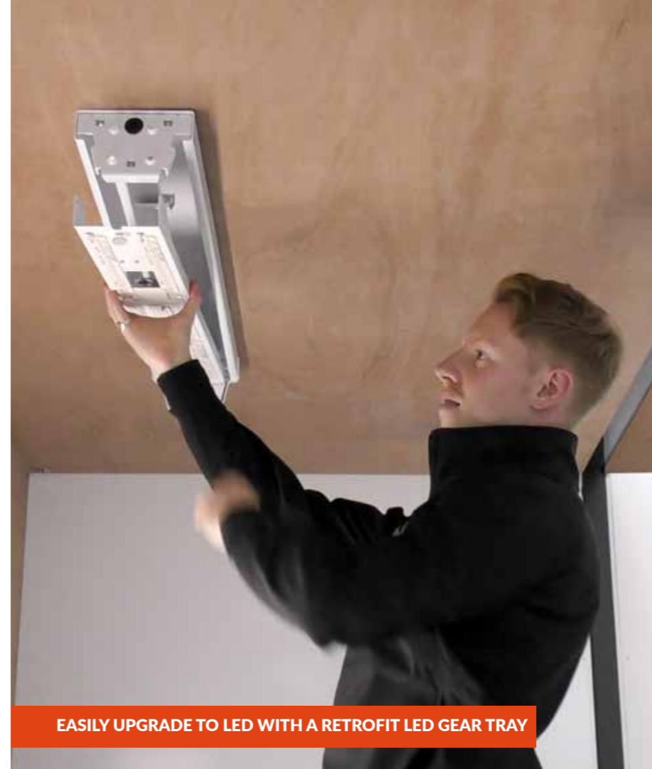
EASILY UPGRADE TO LED WITH A RETROFIT LED GEAR TRAY

Simply replace your fluorescent luminaire's internal control gear with an LED gear tray.